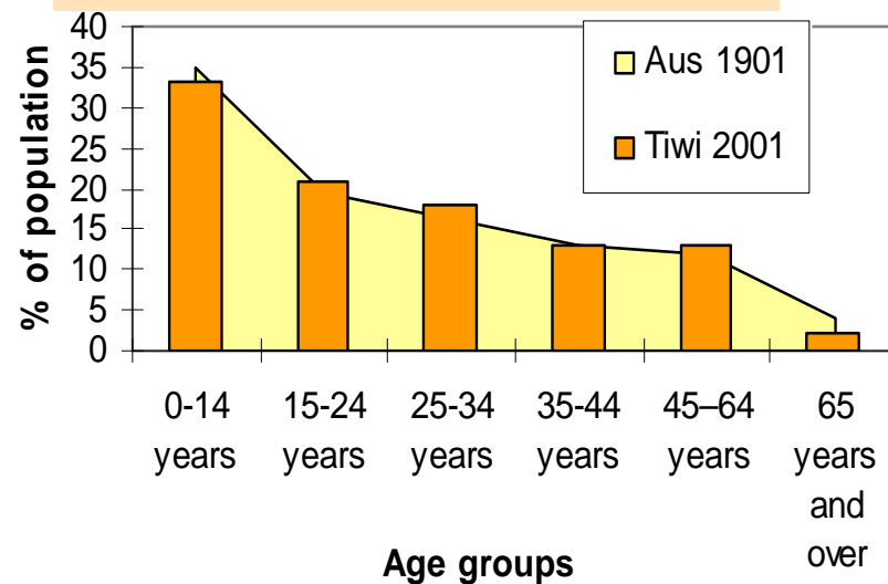
Compare Tiwi 2001 & Australia 1901